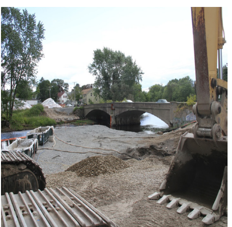
List of FFY 2022 Federally Obligated Projects