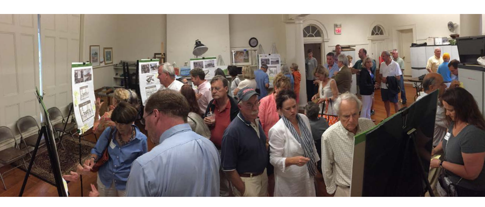
Section 7: Public Hearing Report